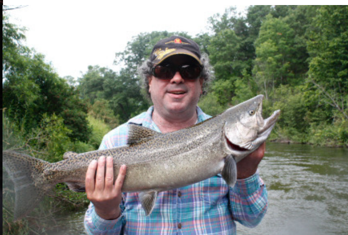
The first PM River king salmon for our crew in 2009... caught on 6 pound line while trout fishing

Indigo Guide Service (231) 898-4320 www.indigoguideservice.com